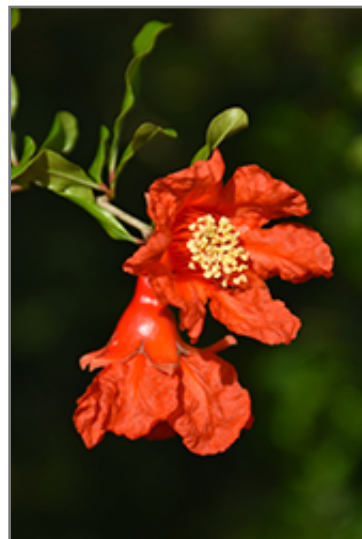
Pomegranate flowers