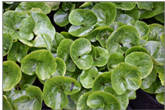
European Wild Ginger foliage Photo courtesy of NetPS Plant Finder