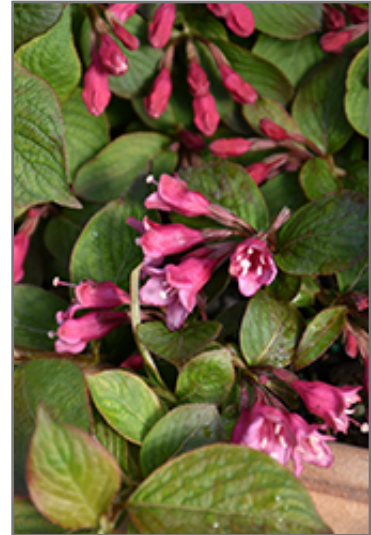
Midnight Sun Reblooming Weigela flowers

Midnight Sun Reblooming Weigela makes a fine choice for the outdoor landscape, but it is also well-suited for use in outdoor pots and containers. It is often used as a 'filler' in the 'spiller-thriller-filler' container combination, providing a mass of flowers and foliage against which the thriller plants stand out. Note that when grown in a container, it may not perform exactly as indicated on the tag - this is to be expected. Also note that when growing plants in outdoor containers and baskets, they may require more frequent waterings than they would in the yard or garden.