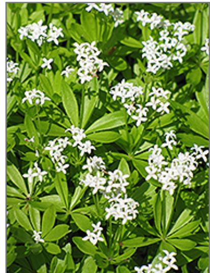
Sweet Woodruff flowers