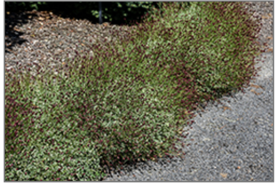
Little Angel Burnet in bloom