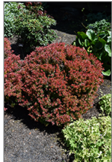
Golden Ruby Barberry